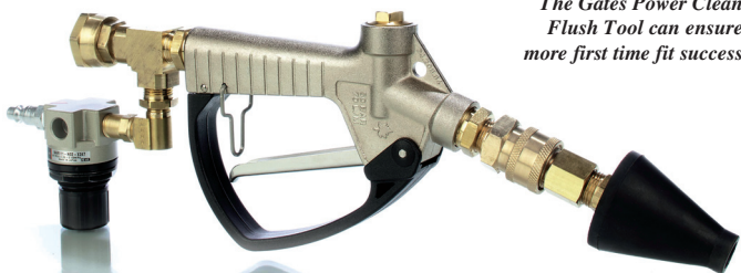
The Gates Power Clean Flush Tool can ensure more first time fit success